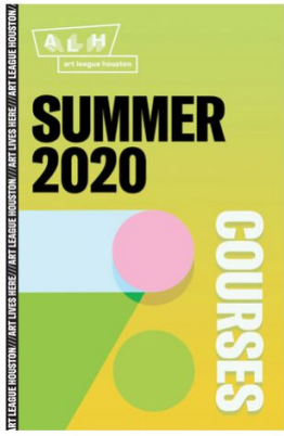
(click above to see full classes and workshops calendar)