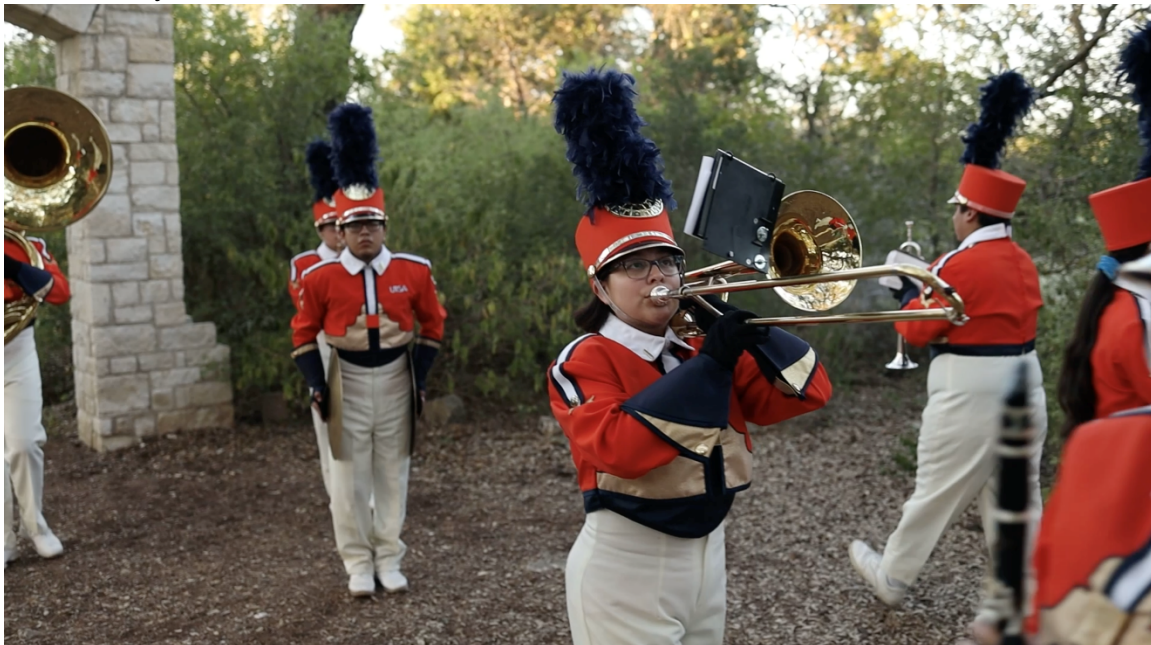
Steve Parker, Sonic Meditation for Marching Band 1 , photograph.

Exhibition Dates: December 16, 2022 – February 11, 2023 Opening Reception: 6 – 8 PM Friday, December 16, 2022 Artist Talks: 2 - 4 PM Saturday, December 17, 2022 Main Gallery