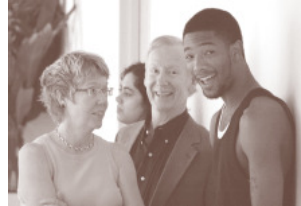
Surviving Katrina & Rita in Houston event

Art League Houston is one of the longest operating non-profit visual arts organizations and was the first alternative art space in Texas. Founded in 1948 and incorporated as a non-profit organization in 1953. Art League Houston was created to promote the public appreciation of and interest in the visual arts. While continuing our commitment to those who believe that visual arts institutions benefit the entire community, you are invited to become a member of Art League Houston and help support one of Houston's most valuable cultural assets. Your membership helps support and sustain the operations of Art League Houston.