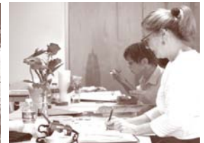
Watercolor class in session