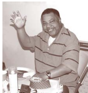
For the 2007 Holidays, students in the Healing Arts program distributed hand-made decorative wreaths to seniors living in assisted-care facilities.

Art League Houston has offered Outreach Programs since 1991. Art League Houston Outreach classes are presented free of charge and provide access to the creative process for individuals in the greater Houston area who often have little or no opportunity for creative outlet or artistic expression. All the Art League Houston Outreach Classes are offered at the Art League Houston School located at 1953 Montrose Blvd. For more information on how to sign up for the Outreach program please contact the Art League Houston office at (713) 523-9530.