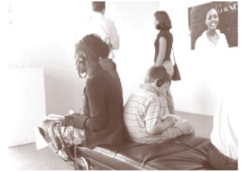
Surviving Katrina & Rita in Houston

Art League Houston is a 501(c)(3) non-profit charitable organization.