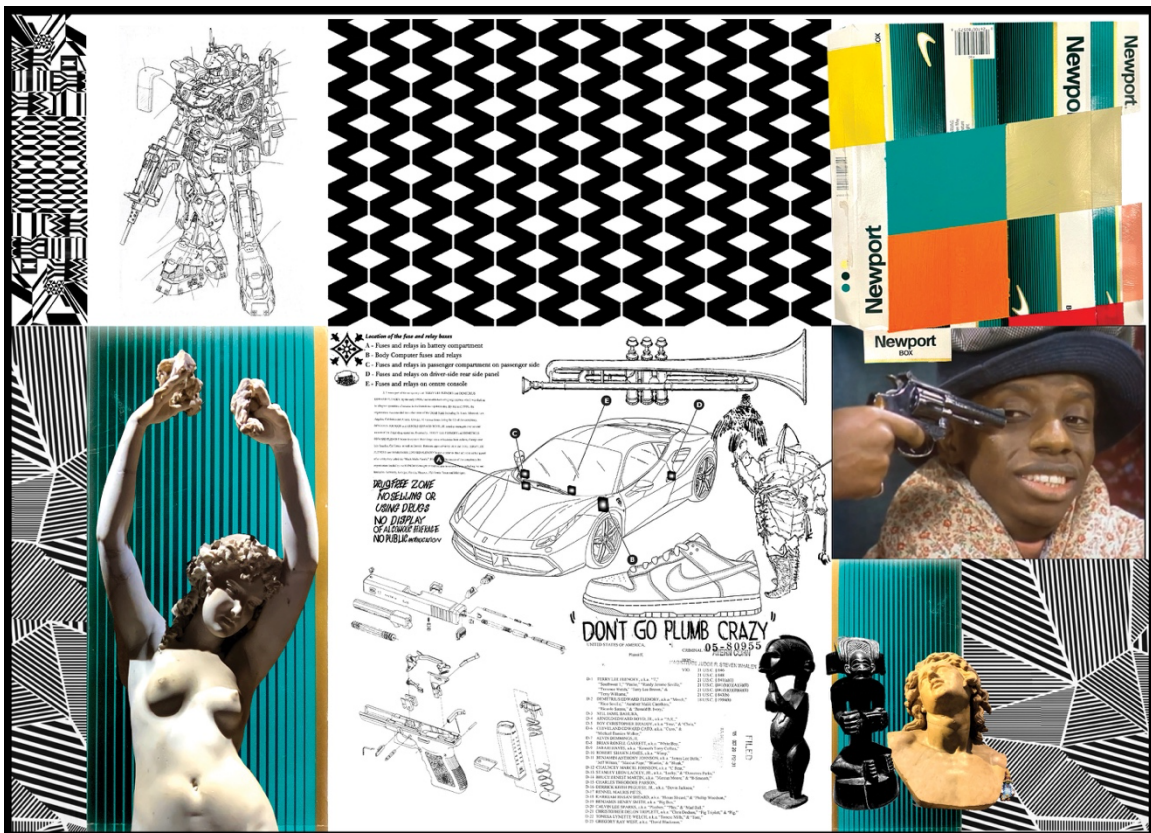
Gregory Michael Carter, We gon put it on the Hood, before we put it on God , Mixed media collage.

Exhibition Dates: December 16, 2022 – February 11, 2023 Opening Reception: 6 – 8 PM Friday, December 16, 2022 Artist Talks: 2 – 4 PM Saturday, December 17, 2022 PLATFORM